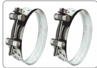
S.S. / M.S BOLT HEAVY TYPE & O.H.T.C. HOSE CLAMP