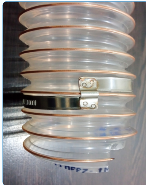
S.S. Bridge Clamp